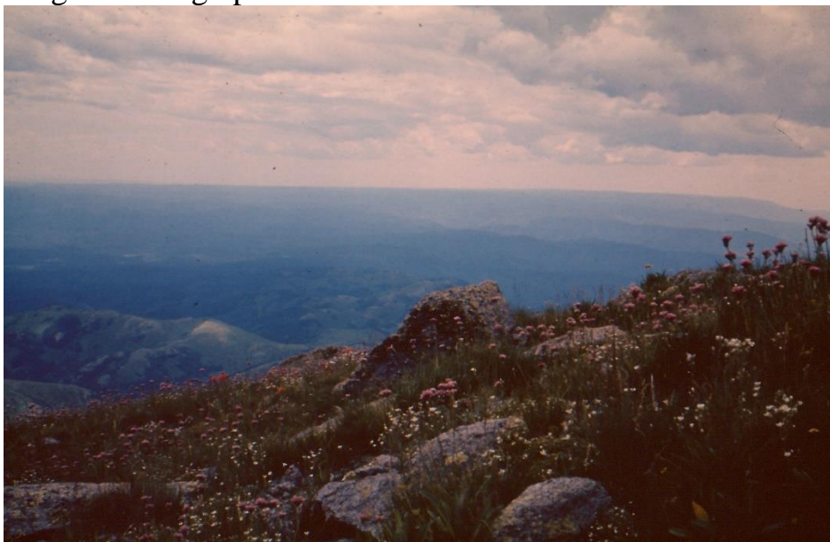
View on the way to top