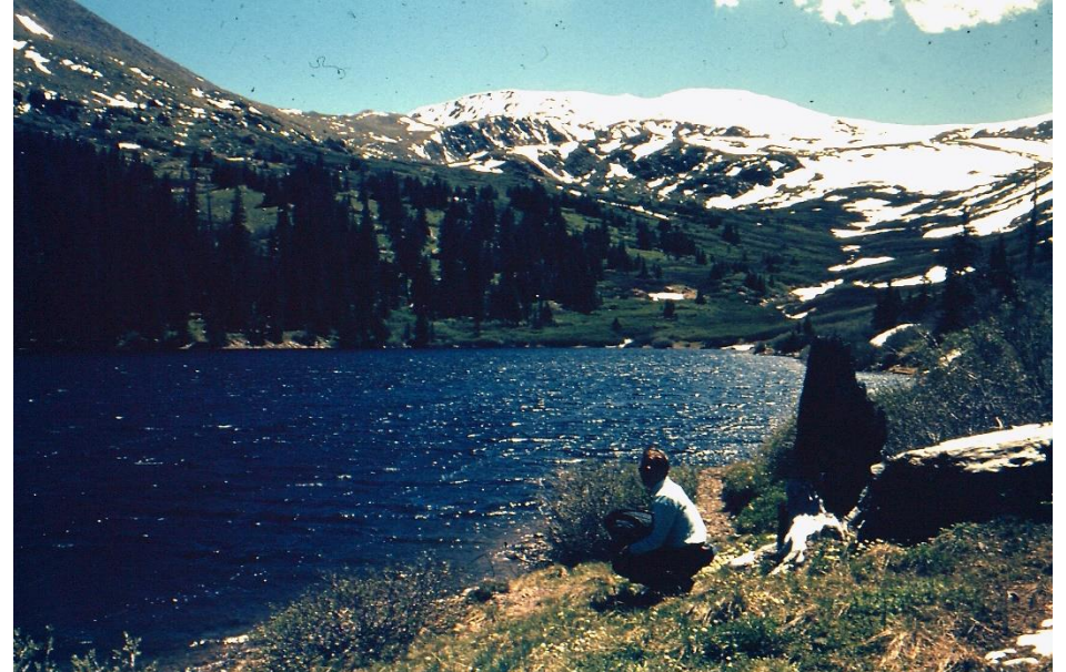
Hans next to mountain lake in Colorado