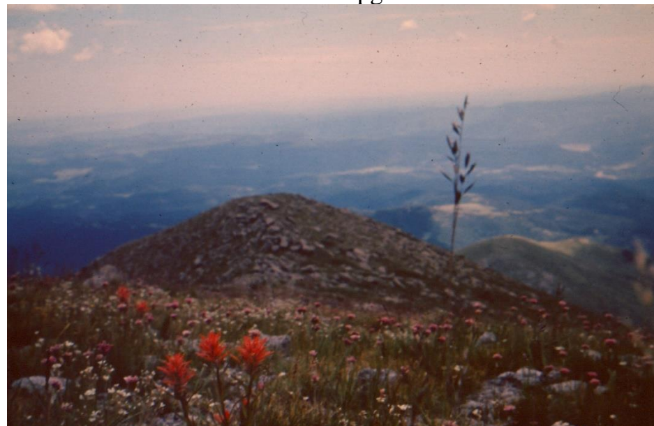
Another view from top