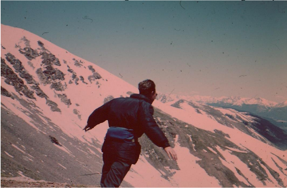
Colorado mountain top with high winds