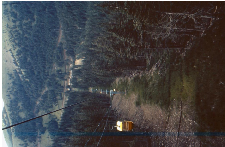
And it gets steeper