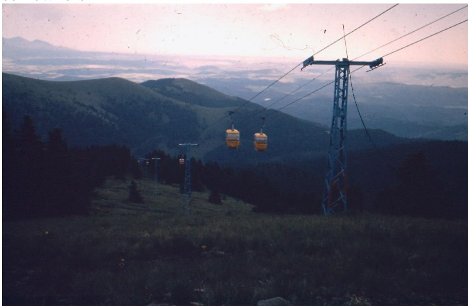
First stage of trip, the Gondola ride