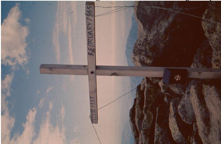
Cross on top of Old Baldy