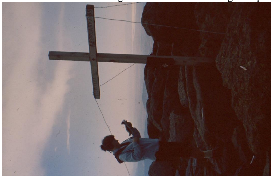
Helga reading the mail left in "Mail box"