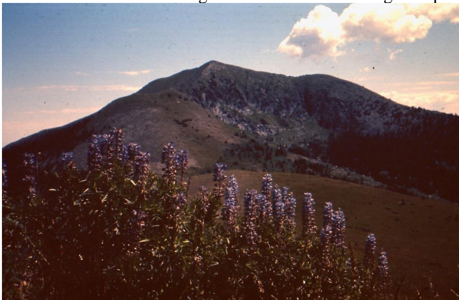
View to destination – Old Baldy There is a cross on top somewhere