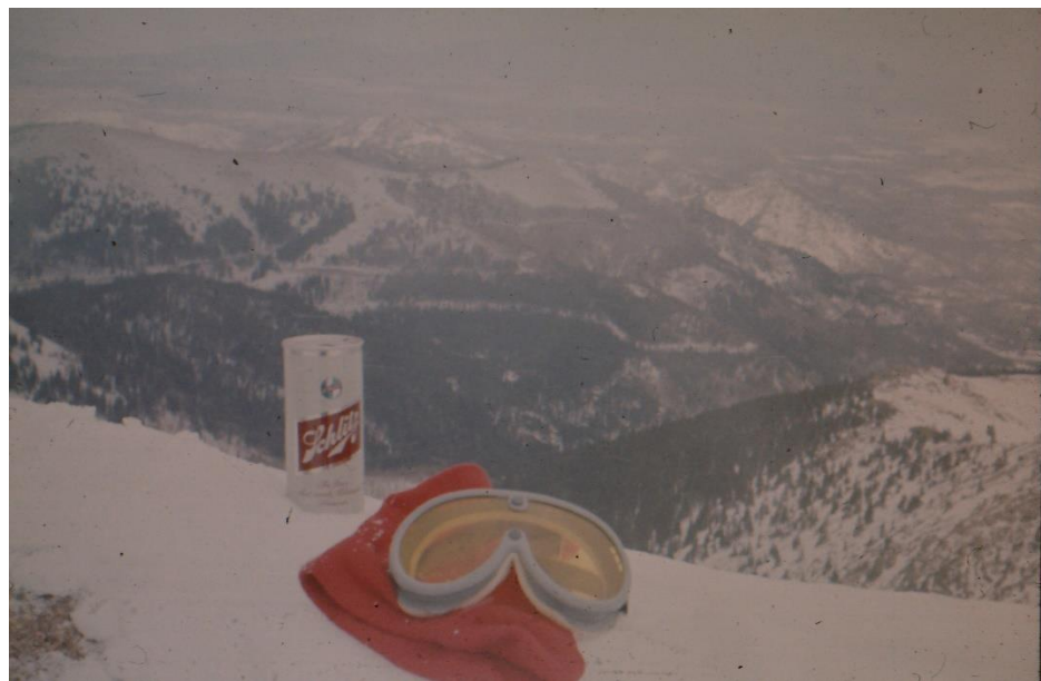
Rehydration and view on top of Old Baldy February 1965