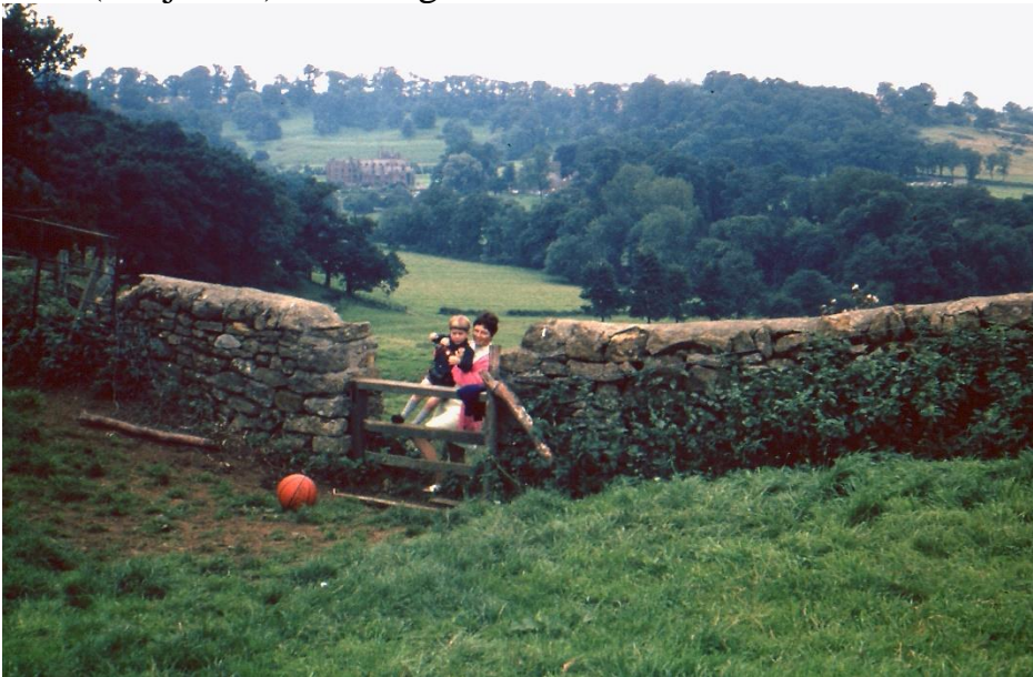
Helga helping Chris over a gate