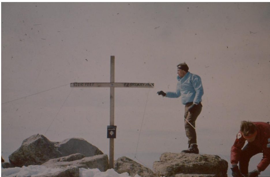
Friend with cross 12,010 feet, February 1965